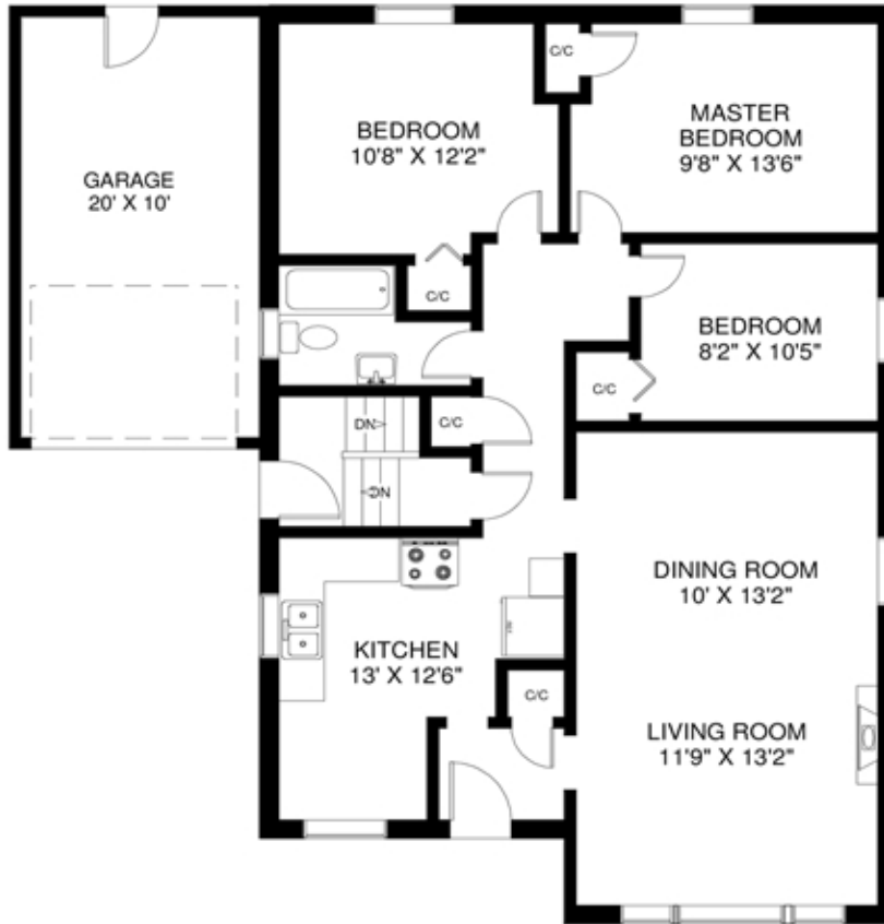
MAIN FLOOR APPROXIMATELY 1,120 SQ FT