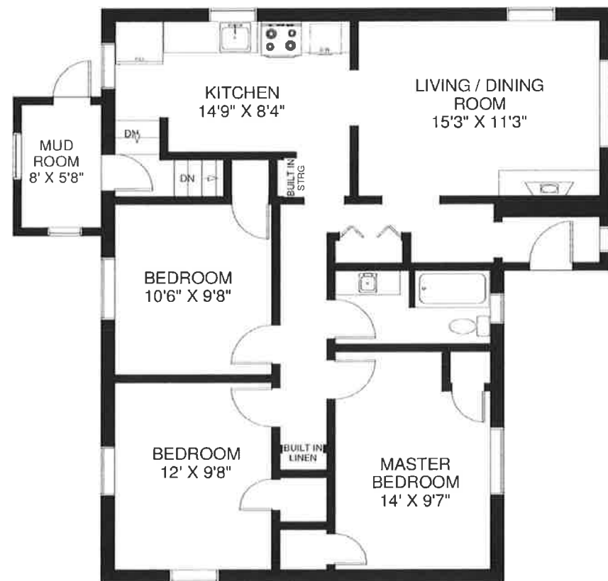
MAIN FLOOR APPROXIMATELY 1,070 SQ FT